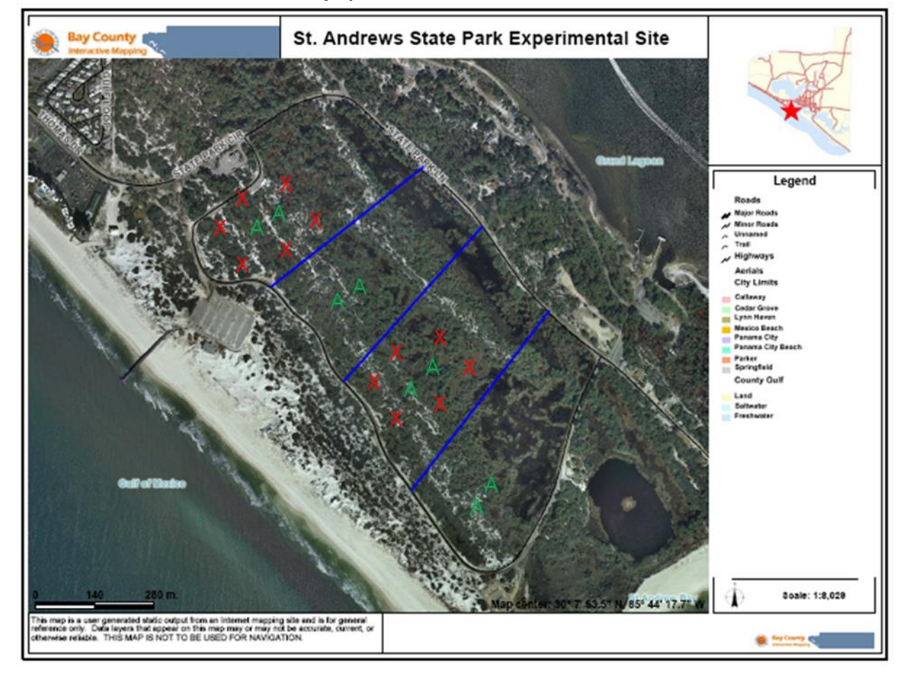
Figure 1. St. Andrews State Park experimental site with four study plots (separated by blue lines) and trap configuration (X - MM-X control traps and A - ABC surveillance traps).

X traps). The MM-X traps were set to run 24/7 with CO<sub>2</sub> emitted during the crepuscular and throughout the evening hours. Layout of the treatments was: treatment, control, treatment and control site. The MM-X traps were operated for one month at the initial location and then rotated to the adjacent treatment site and so on each month until a cycle through all sites was completed over four months in a 4 treatment X 4 location Latin-square design. The entire experiment was repeated a second time over the following four months. Thus, traps were operated continuously from the first week in March, 2008 until the third week in November, 2008.